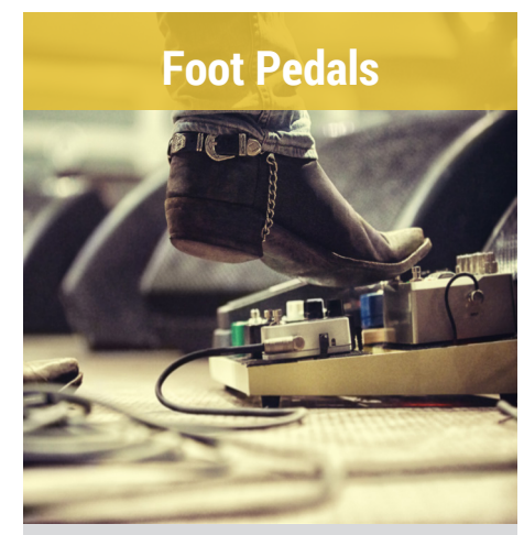
Most popular models include: P160, P230, P231, P232 and P270 series.