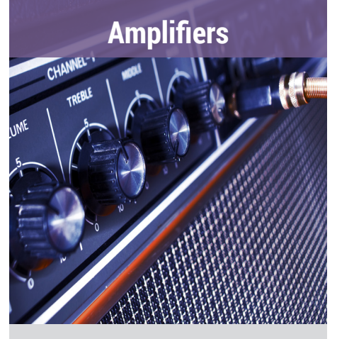
Most popular models include: P160, P260 and P270 series.

To check inventory with our global distributor network, visit: http://dilp.netcomponents.com/ttelectronics.html