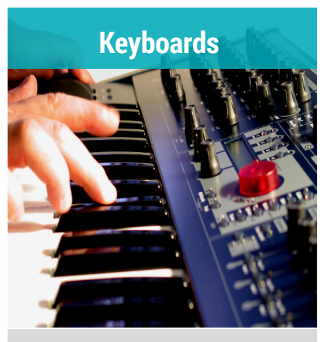
Most popular models include: P090S, P090L series, EN11, EN12 and EN16 panel encoders.